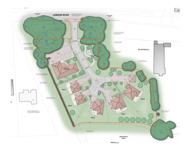
Figure 4 – Site Layout (21/00759/AOP)

dwelling houses and a scout hut. Consent was granted in August 2021. The site layout is shown below in Figure 4.