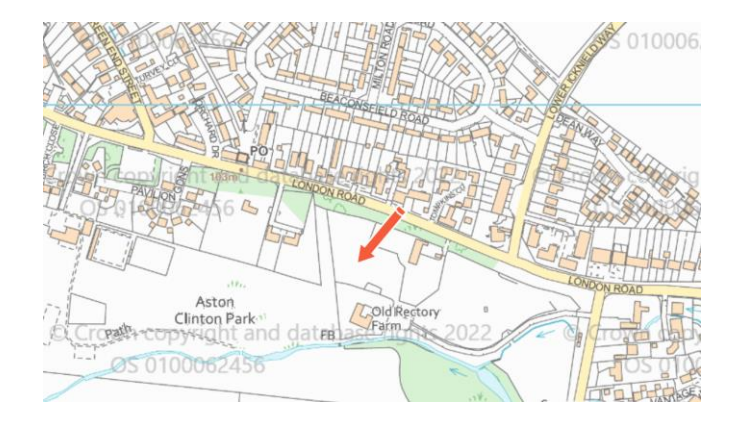
Figure 1 – Land adjacent to the Old Rectory, London Road, Aston Clinton

2.2 The subject land was originally part of a larger site owned by Buckinghamshire County Council and was sold in the 1930s. The original site (the 'original site') extended to just in excess of 10 acres (Figure 2) but has been broken up over the years into a number of separate parcels including the subject land. All of these are now in private ownership.