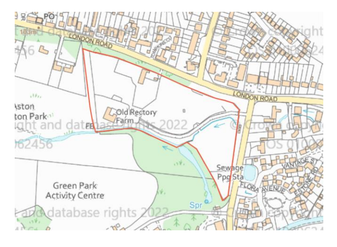
Figure 2 – Land covered by the original conveyance

2.2 The subject land was originally part of a larger site owned by Buckinghamshire County Council and was sold in the 1930s. The original site (the 'original site') extended to just in excess of 10 acres (Figure 2) but has been broken up over the years into a number of separate parcels including the subject land. All of these are now in private ownership.