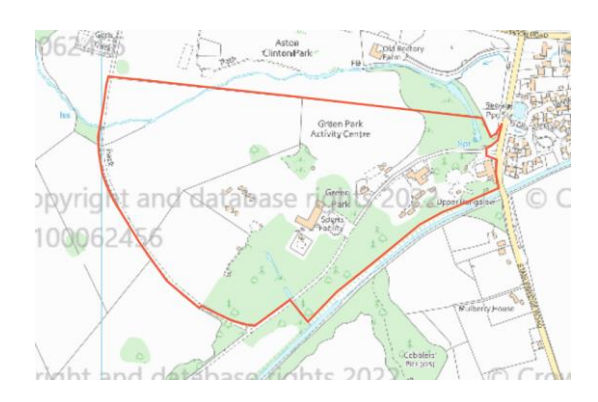
Figure 5 – Green Park