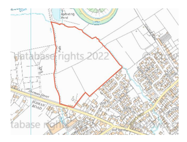
Figure 6 - Bulls Field